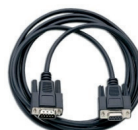
PM001601 Programming cable pg. 98